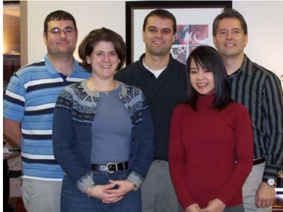
Happy Holidays From Software Concepts International